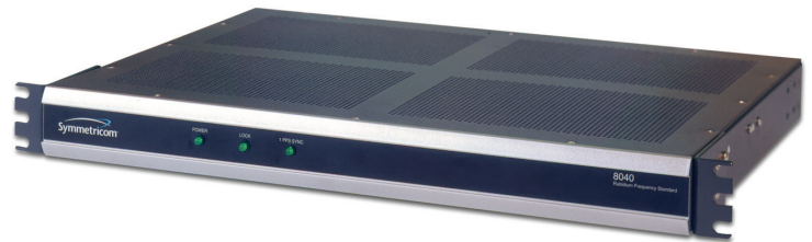
Figure: Rubidium 8040C

Besides its military applications, the 8040C also provides frequency accuracy to television and radio broadcasters that need to ensure their broadcast frequency remains within their allotted range. Drifting outside of this range interferes with transmissions from other broadcasters and can result in significant fines from the FCC. The 8040C helps broadcasters avoid penalties by eliminating out-of-band emissions that cause co-channel interference.