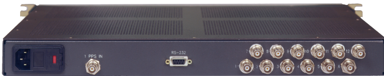
Figure: Rubidium 8040C - Rear Panel

tel: 408.433.0910 fax: 408.428.7896 info@symmetricom.com www.symmetricom.com