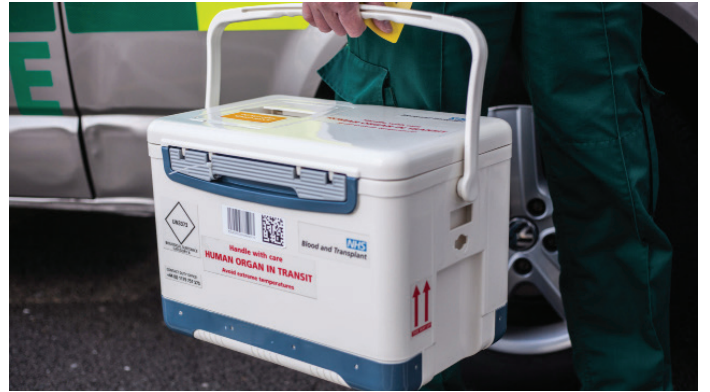
Blood & Organ Transport