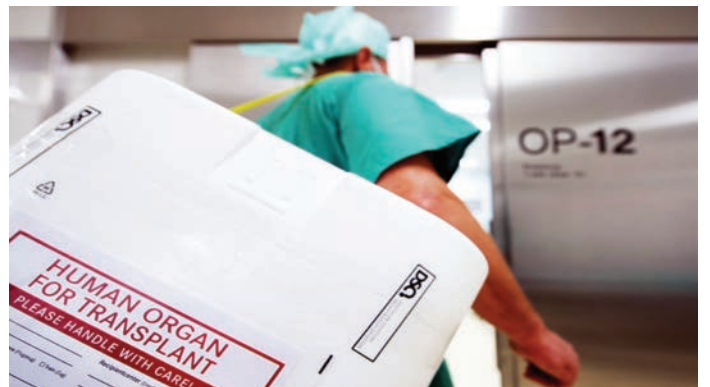
Blood & Organ Transport