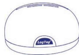
LTI-HID Not Included