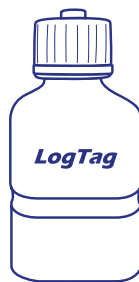
Glycol Buffer Not Included