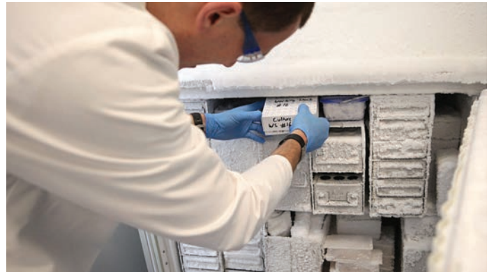
Low Temperature Conditions