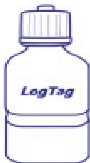
Glycol Buffer Not Included