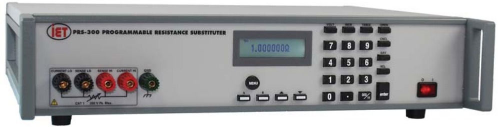
PRS 300 Resistance Substituter

Can be used at an automated resistance carousel with built-in EIA "preferred value" resistance tables of 1% (E96), 5% (E24), 10% (E12) increments or user specified increment.